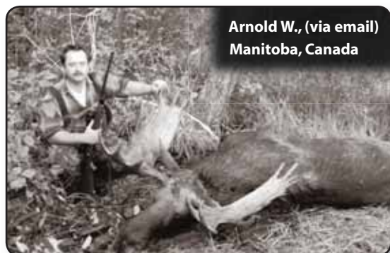
Arnold W., (via email) Manitoba, Canada

"I am writing to praise you about the new InterBond 165 gr. bullets. I used them on a very successful hunting trip – shooting a 1,350 lb. moose. The first shot went into the lower chest taking out the bottom of the lung. The second went into the neck area. The moose went down after taking just one step. Neither shot went through...putting good energy into the kill. We did not throw away any meat due to bullet damage. The bullets opened up to a good mushroom size, and when I weighed them, they still had 97% of their original weight!"