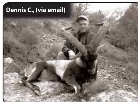
Dennis C., (via email)

"I am writing to praise you about the new InterBond 165 gr. bullets. I used them on a very successful hunting trip – shooting a 1,350 lb. moose. The first shot went into the lower chest taking out the bottom of the lung. The second went into the neck area. The moose went down after taking just one step. Neither shot went through...putting good energy into the kill. We did not throw away any meat due to bullet damage. The bullets opened up to a good mushroom size, and when I weighed them, they still had 97% of their original weight!"