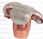
30 cal. 150 gr. 2463 FPS Retained 141 gr. 94% Wt. Ret. .692" Expanded

When it comes to applying science to the art of hunting, there's never been a better example than the Hornady InterBond.